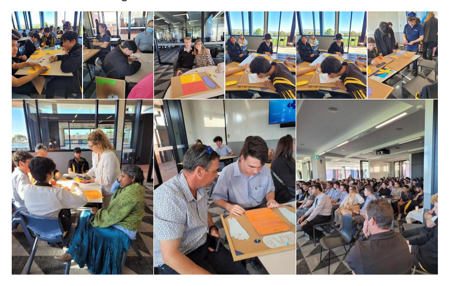
Year 9 Rites of Passage