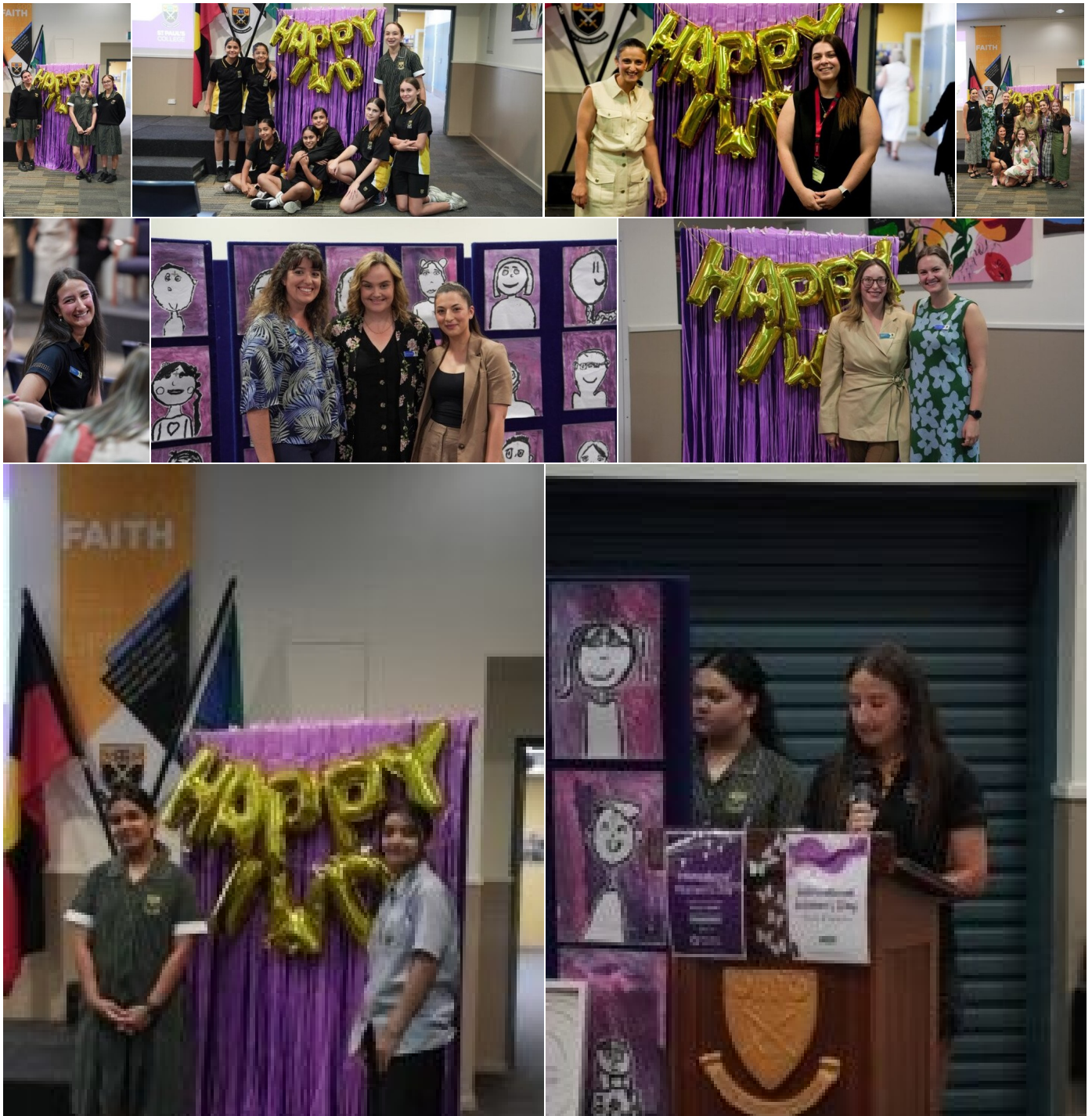
2025 International Women's Day