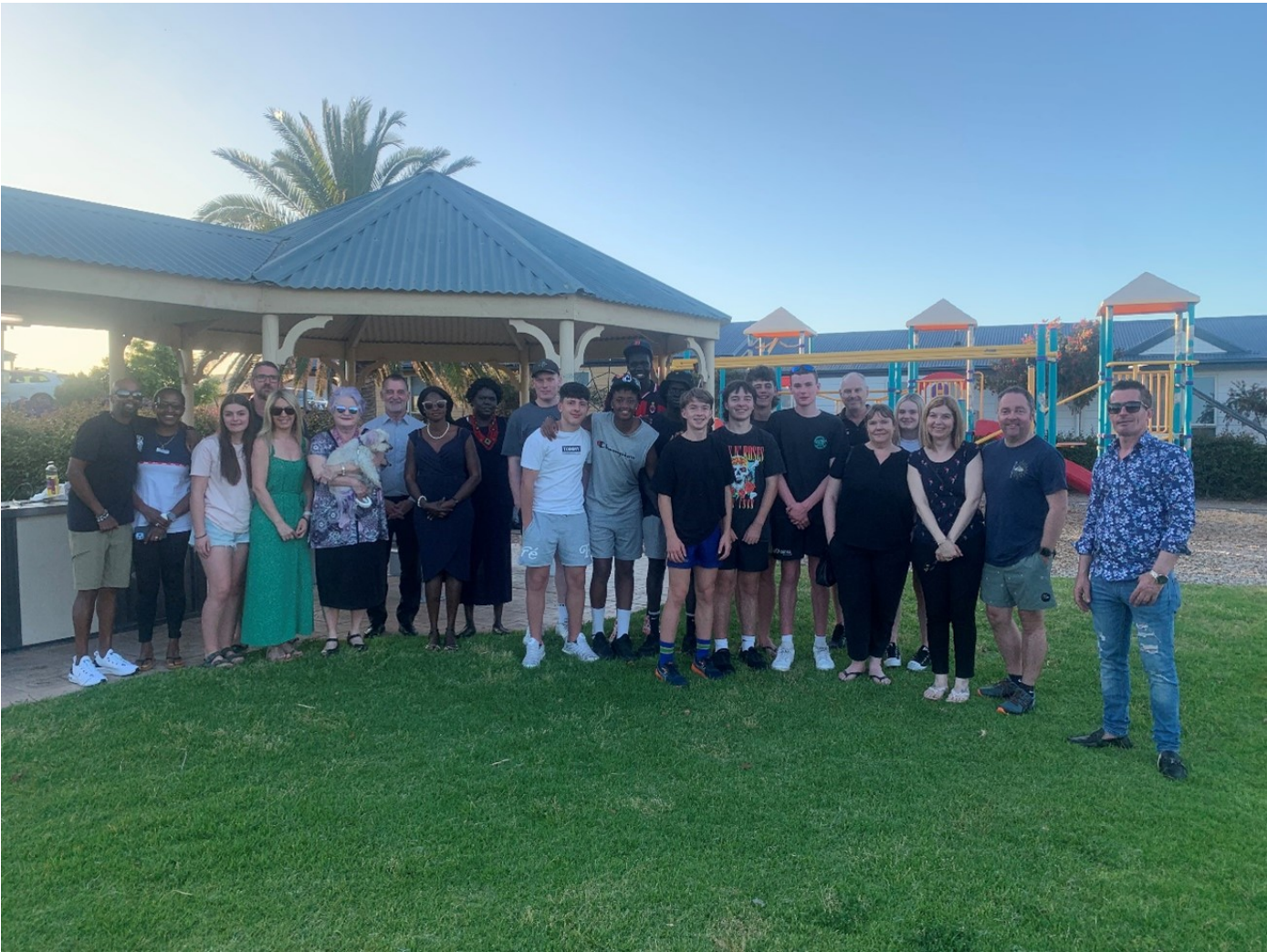
Our 2023 Prefect team have been on camp at West Beach this week. They participated in various leadership and team building activities and spent time articulating their leadership vision for the year ahead. We know they will do an outstanding job in 2023!